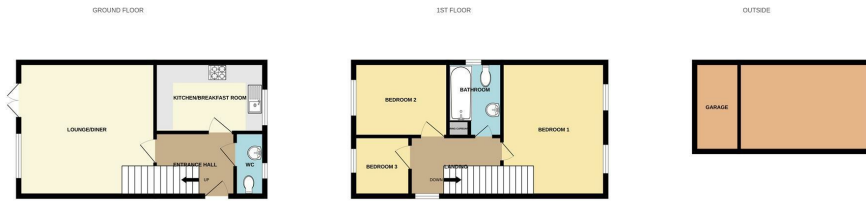
25 FULWOOD DRIVE, LONG EATON

Whilst every attempt has been made to ensure the accuracy of the floorplan contained here, measurements of doors, windows, rooms and any other items are approximate and no responsibility is taken for any error, omission or mis-statement. This plan is for illustrative purposes only and should be used as such by any prospective purchaser. The services, systems and appliances shown have not been tested and no guarantee as to their operability or efficiency can be given. Made with Metropix ©2023